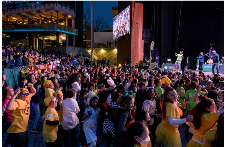
2022 Battle of the Books at Merriweather

We will continue to foster and seek to perfect an environment where artists and guests are comfortable, feel welcome, and know that their needs will be accommodated.