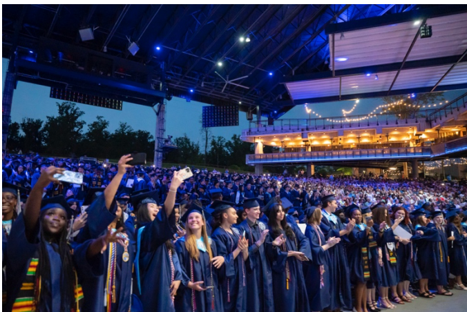
2022 Howard County High School Graduations at Merriweather

We believe the arts can help build community and are an important component in fulfilling the values upon which Columbia was founded.