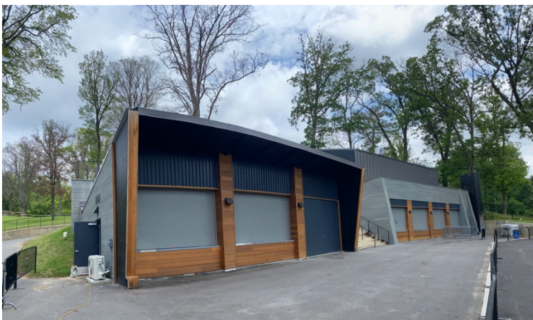
New re-leveled concession plaza with merchandise stand and elevator

The third phase of the renovation project included the construction of a new concession stand, bathrooms, box office, VIP deck, and office/warehouse space for operations in the venue's “South Plaza.” Construction on this phase began in October of 2016, and it was fully completed by September of 2017.