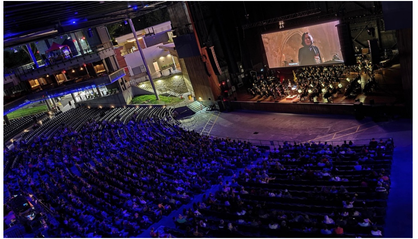
The BSO's Film with Orchestra – Harry Potter and the Sorcerer's Stone