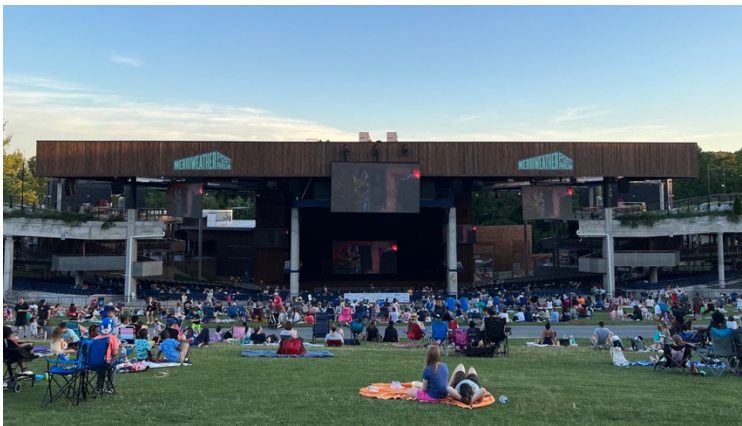
Merriweather Movie Nights - Encanto

The Commission's operations are funded primarily by the rent payments it receives from IMA under the terms of the lease. In 2022, the Commission also received grant funding to support operations from the Maryland State Arts Council and Howard County Government. In addition, it received funding in the form of donations and sponsorships from individuals and businesses in Howard County, and while the bulk of its programming was offered to the community free of admission charges, DCACC earned programming income related to a few of the events it produced and/or presented.