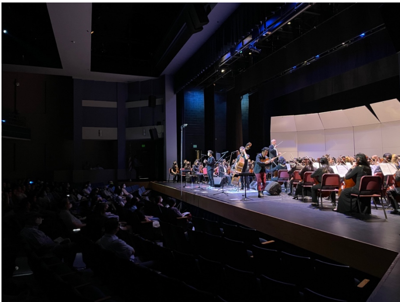
Time For Three with the HoCo High School Gifted and Talented Orchestra

In May, DCACC worked with long-time partners and collaborators at the Columbia Festival of the Arts and the Howard County School System Fine Arts department to present 'Time for Three with the Howard County High School Gifted and Talented Orchestra.' Time for Three, a classically trained string trio from Indianapolis, traveled to make a special appearance with student musicians from all twelve high schools. And, as hoped, they gave the experience of a lifetime to The Howard County High School Gifted and Talented Orchestra, along with 700 other students, friends, and family members who crowded into the Jim Rouse Theatre for an enthralling afternoon of music from all different genres.