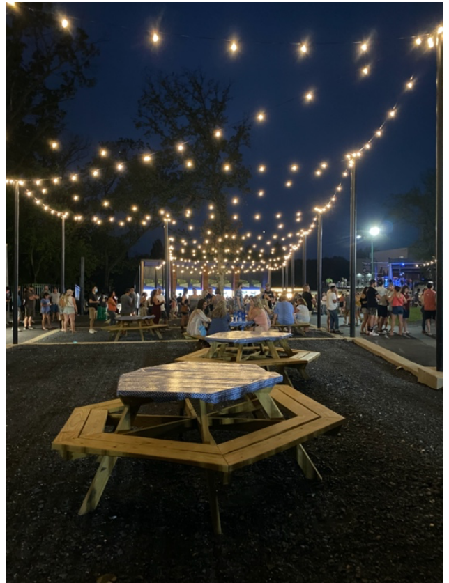
New seating area near Merriweather lawn

Named as one of the top four amphitheaters in the country by Rolling Stone magazine, Merriweather Post Pavilion is a driver of significant economic impact for Downtown Columbia and the entire central Maryland region, drawing more than 300,000 guests each year. Officially, the venue seats 19,000 guests, but its capacity often expands during festival shows, which make use of Merriweather Park at Symphony Woods, the parkland surrounding the pavilion.