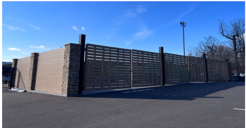
New dumpster enclosure and re-surfaced and re-stripped shared parking area.

Finally, as discussed, the last portion of the fifth phase of construction included a resurfacing of the parking lot Merriweather shares with Symphony Woods, as well as the construction of a discreet area to store dumpsters used by Merriweather Post Pavilion in its operations.